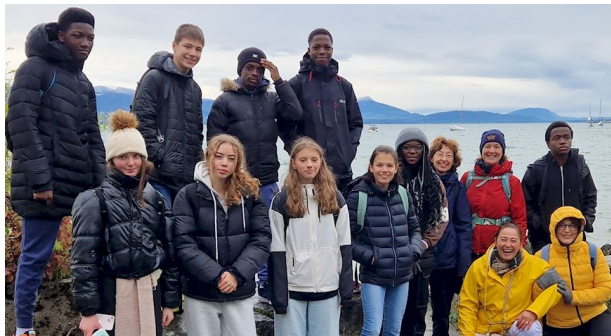
Les élèves et les partenaires suisses