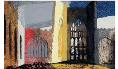
Coventry Cathedral By John Piper 1940