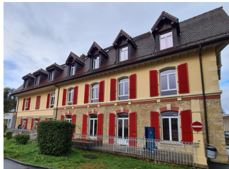
L'École de 'La Bergerie'