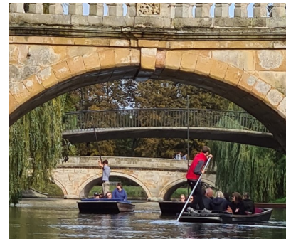
En bateau à Cambridge